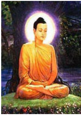
Many Jews, Christians and Muslims pray to make contact with a God outside themselves while Hindus, Buddhists and Taoists meditate to connect to the God within.

In Hindu art, the divine feminine is the sub-conscious object of devotion. Even though the Hindu God's are identified as male, they are depicted in very feminine representations.